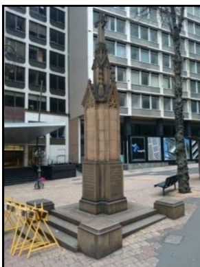
The Richard Johnson Memorial sits on the site of Australia's first church.