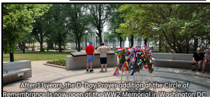
After 11 years, the D-Day Prayer addition at the Circle of Remembrance is now open at the WW2 Memorial in Washington D.C.